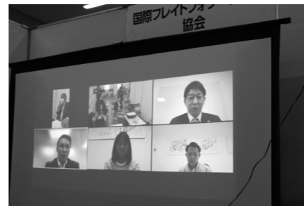
JIFFA will continue to support human resource development activities.

April. The attending students asked many questions as the online discussions were a precious opportunity to directly speak with first-line workers in charge of freight forwarding in other countries. The students heard from their discussion partners what hardships they have had and what job satisfactions they have acquired in their places of work, prehistories of their overseas assignments and so on.